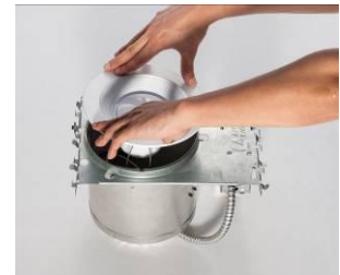
Step3: Insert LED trim.