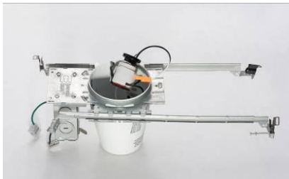
Step1: Twist adaptor into socket.