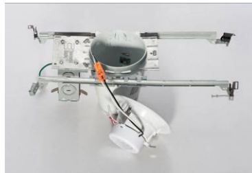
Step2: Insert male connector into female one.